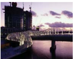
Bridges & Underwater