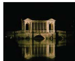
Garden & Security