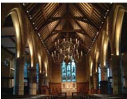
Places of Worship

Light Projects Group - An industry leader in the design, manufacture and supply of lighting fittings.